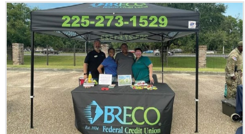
NIGHT OUT AGAINST CRIME AUGUST 2023

BRECO's CEO "Hikes the Hill" in Washington D.C. to meet with Senator Cassidy and others to discuss issues that affect Louisiana.