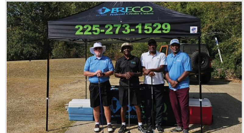
CHARITY GOLF TOURNAMENT NOVEMBER 6, 2023

BRECO Board Members participate in the credit union charity golf tournament, which raised over $40K for the Baton Rouge Children's Advocacy Center.