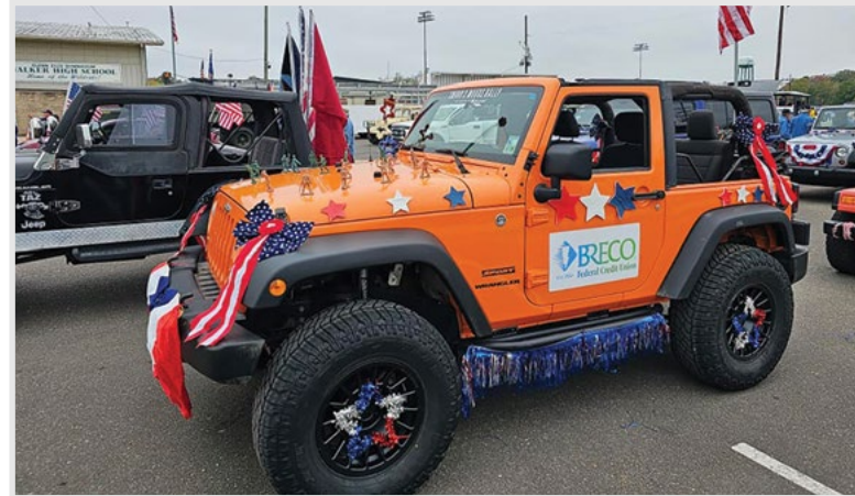
WALKER, LA ANNUAL VETERANS DAY PARADE NOVEMBER 11, 2023