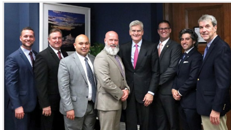
HIKE THE HILL SEPTEMBER 12, 2023

BRECO Board Members participate in the credit union charity golf tournament, which raised over $40K for the Baton Rouge Children's Advocacy Center.